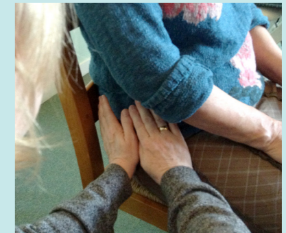
Base of spine to hip