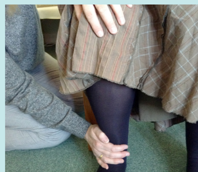
Knee to ankle