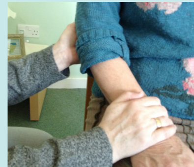
Elbow to wrist