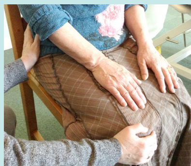
Hip to knee