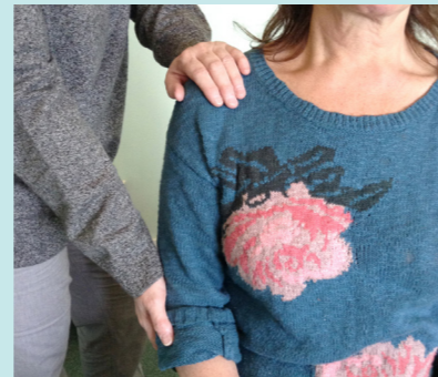
Shoulder to elbow