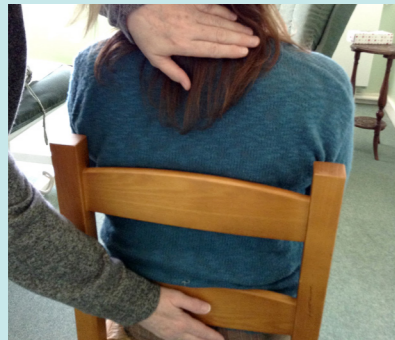
Beginning with nape of neck to base of spine.