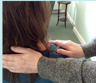
Nape of neck to shoulder