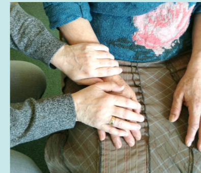
Wrist to fingertips